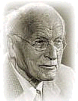
Carl Gustav Jung

This material is copyright protected. © 2001 All rights reserved. Any Parts or the whole may not be copied without the express written consent of the author. XD888@aol.com