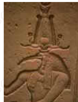
Thoth The Atlantean

“When unto thee comes a feeling drawing thee nearer to the dark gate, examine thine heart and find if the feeling thou hast cometh from within. If thou shalt find the darkness thine own thoughts, banish them forth from place in thy mind. Send through the body a wave of vibration... ..repeating time after time until free. ...Only by knowing can thou overcome it... ..Know ye ever that as Light fills thy being, darkness for thee shall soon disappear.” Translation by Doreal, The Emerald Tablets of Thoth-the-Atlantean